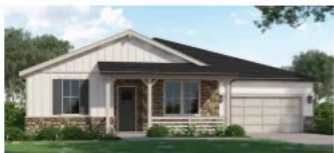
2AR - Traditional Farmhouse (Modeled)