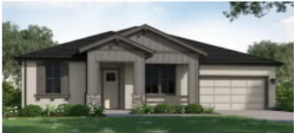
2CR - Napa Valley