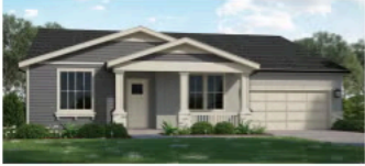
2BR - Americana