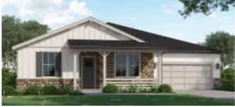
2AR - Traditional Farmhouse (Modeled)