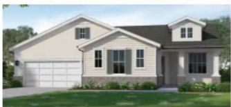
IB - Americana (Modeled)