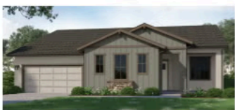
IC - Napa Valley