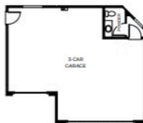
OPTIONAL 3-CAR GARAGE

New Home Specialist • (925) 281-3227 • Sales@TrumarkHomes.com Origin Sales Gallery • 1315 Parkcrest Circle, Manteca, CA 95336 • (209) 803-6151 • OriginManteca.com