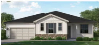
IA - Traditional Farmhouse