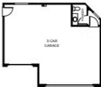
OPTIONAL 3-CAR GARAGE

New Home Specialist • (925) 281-3227 • Sales@TrumarkHomes.com Origin Sales Gallery • 1315 Parkcrest Circle, Manteca, CA 95336 • (209) 803-6151 • OriginManteca.com