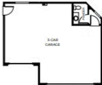
OPTIONAL 3-CAR GARAGE

New Home Specialist • (925) 281-3227 • Sales@TrumarkHomes.com Origin Sales Gallery • 1315 Parkcrest Circle, Manteca, CA 95336 • (209) 803-6151 • OriginManteca.com