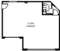
OPTIONAL 3-CAR GARAGE

New Home Specialist • (925) 281-3227 • Sales@TrumarkHomes.com Origin Sales Gallery • 1315 Parkcrest Circle, Manteca, CA 95336 • (209) 803-6151 • OriginManteca.com