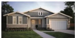
ICR - Craftsman