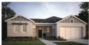
IAR - Contemporary Farmhouse