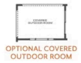
OPTIONAL COVERED OUTDOOR ROOM