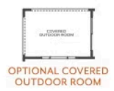
OPTIONAL COVERED OUTDOOR ROOM