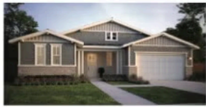
ICR - Craftsman