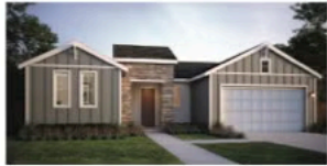
IBR - Napa Valley Classic