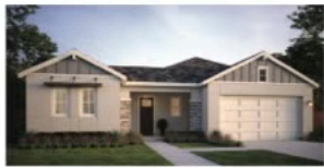
IAR - Contemporary Farmhouse