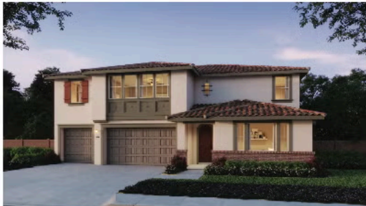
ELEVATION B – SPANISH COLONIAL