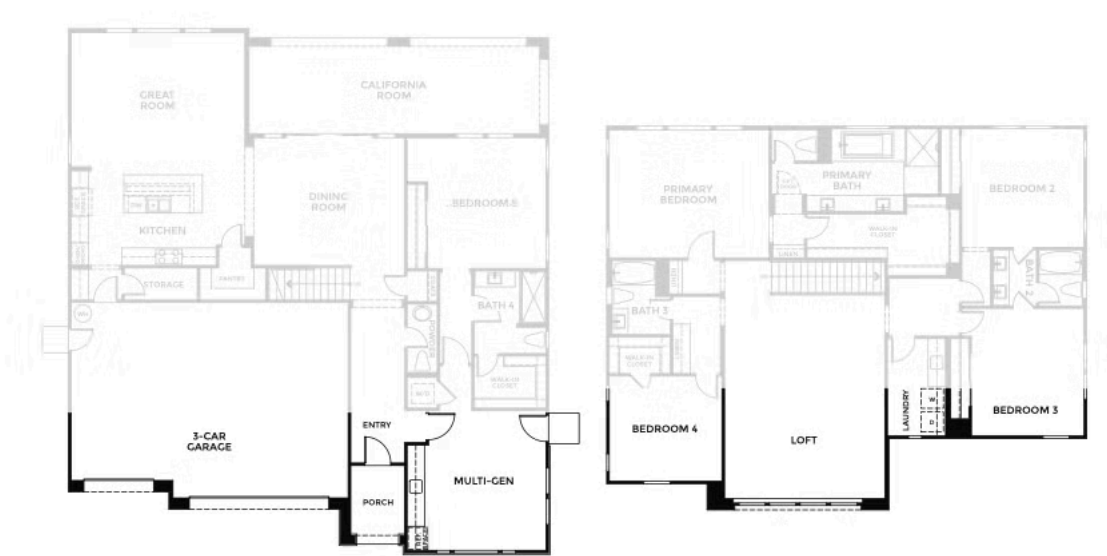
FIRST FLOOR - ELEVATION B

5 Bedrooms • 4.5 Baths • Multi-Gen • Loft • California Room • 3-Car Garage Approx. 4,043 Finished Sq. Ft.