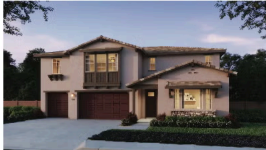
ELEVATION A – ADOBE RANCH

5 Bedrooms • 4.5 Baths • Multi-Gen • Loft • California Room • 3-Car Garage Approx. 4,043 Finished Sq. Ft.