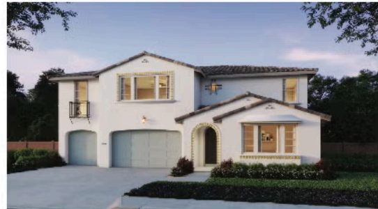
ELEVATION C – SANTA BARBARA