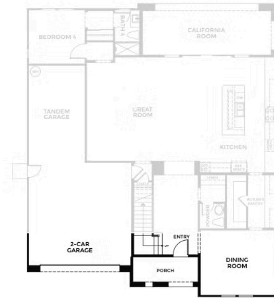
FIRST FLOOR - ELEVATION B

4 Bedrooms · 4.5 Baths · Loft · California Room · 3-Car Tandem Garage Approx. 3,601 Finished Sq. Ft.