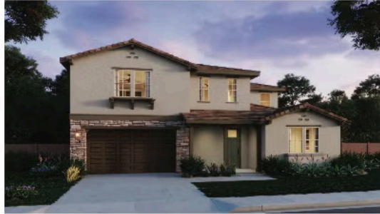
ELEVATION A – ADOBE RANCH

4 Bedrooms • 4.5 Baths • Loft • California Room • 3-Car Tandem Garage Approx. 3,601 Finished Sq. Ft.