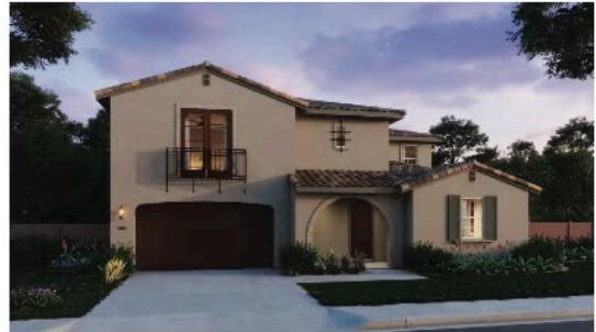
ELEVATION C – SANTA BARBARA