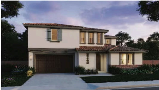
ELEVATION B – SPANISH COLONIAL