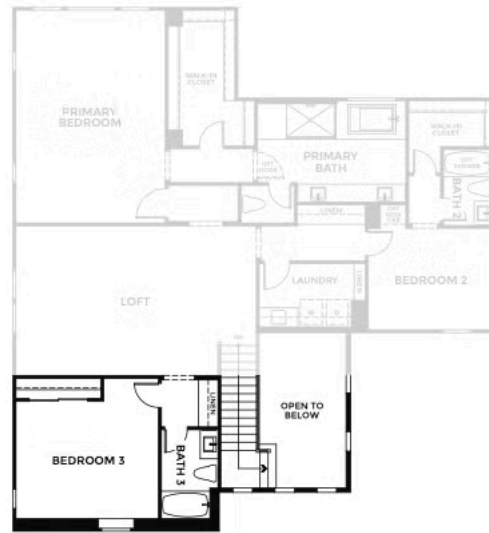
SECOND FLOOR - ELEVATION B