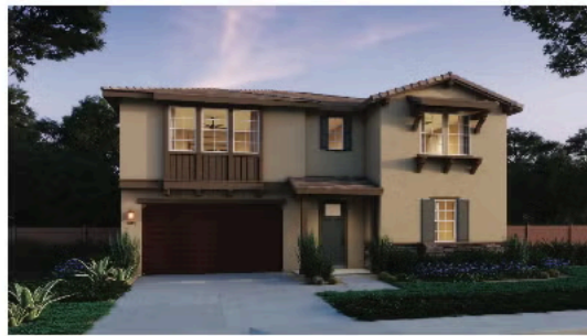
ELEVATION A – ADOBE RANCH

5 Bedrooms • 4 Baths • Loft • California Room • 3-Car Tandem Garage Approx. 3,119 Finished Sq. Ft.