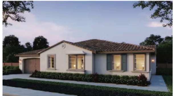
ELEVATION C – SANTA BARBARA