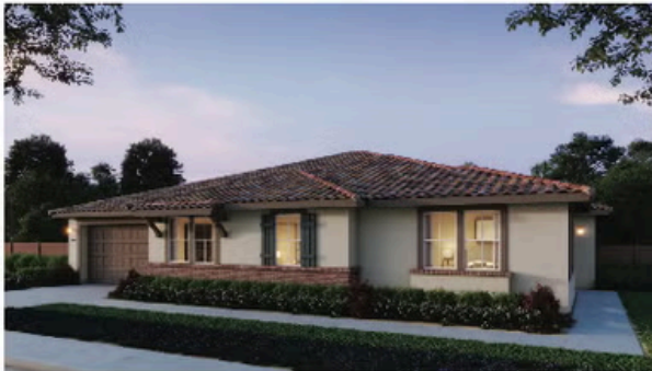
ELEVATION B – SPANISH COLONIAL