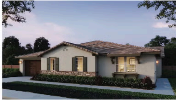
ELEVATION A – ADOBE RANCH

3 Bedrooms · 3.5 Baths · Play Room · California Room · 3-Car Tandem Garage Approx. 3,100 Finished Sq. Ft.