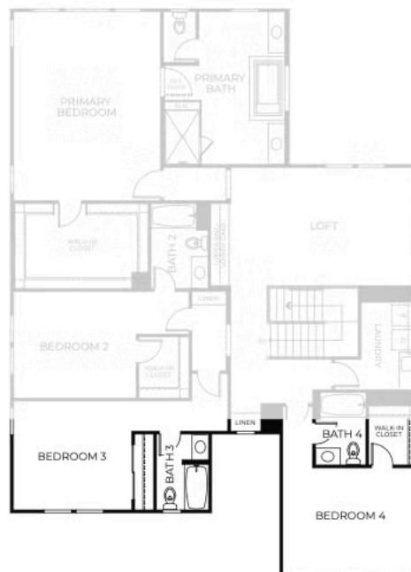
SECOND FLOOR - ELEVATION E

Preliminary and subject to change. 909-570-8617 | ShadyViewSales@TrumarkHomes.com | 18189 Via La Cresta, Chino Hills, CA 91709 | VIP-SHADYVIEW.COM