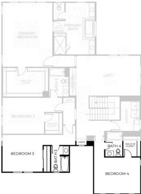
SECOND FLOOR – ELEVATION E

Preliminary and subject to change. 909-570-8617 | ShadyViewSales@TrumarkHomes.com | 18189 Via La Cresta, Chino Hills, CA 91709 | VIP-SHADYVIEW.COM