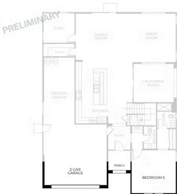
FIRST FLOOR – ELEVATION E

5 Bedrooms • 5.5 Baths • Flex Room • Loft • California Room • 2-Car Garage with Tandem Garage Approx. 3,923 Finished Sq. Ft.