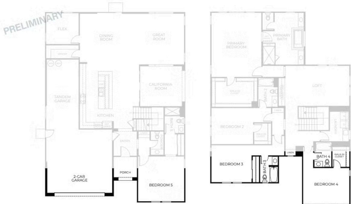
FIRST FLOOR – ELEVATION E

5 Bedrooms • 5.5 Baths • Flex Room • Loft • California Room • 2-Car Garage with Tandem Garage Approx. 3,923 Finished Sq. Ft.