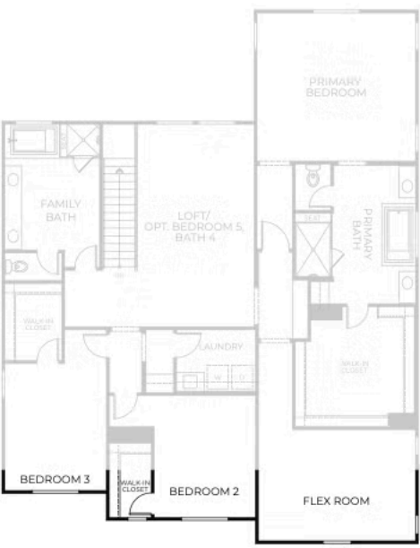
SECOND FLOOR - ELEVATION F

Preliminary and subject to change. 909-570-8617 | ShadyViewSales@TrumarkHomes.com | 18189 Via La Cresta, Chino Hills, CA 91709 | VIP-SHADYVIEW.COM