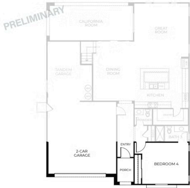
FIRST FLOOR - ELEVATION E

4 Bedrooms · 3.5 Baths · Loft · Flex Room · California Room · 2-Car Garage with Tandem Garage Approx. 3,539 Finished Sq. Ft.