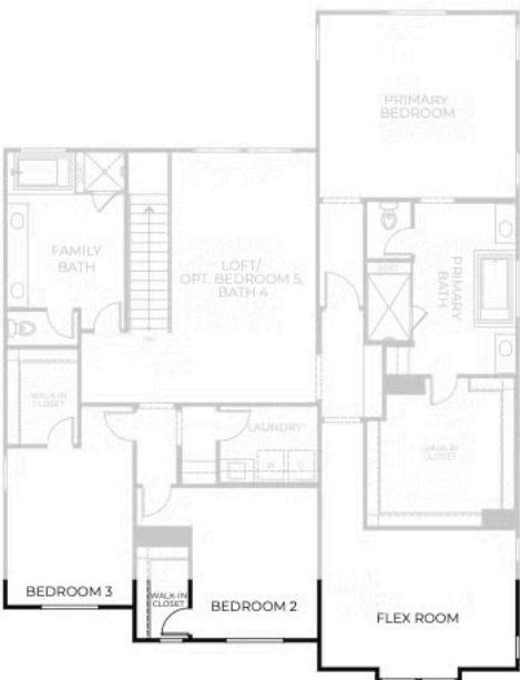
SECOND FLOOR - ELEVATION E

Preliminary and subject to change. 909-570-8617 | ShadyViewSales@TrumarkHomes.com | 18189 Via La Cresta, Chino Hills, CA 91709 | VIP-SHADYVIEW.COM