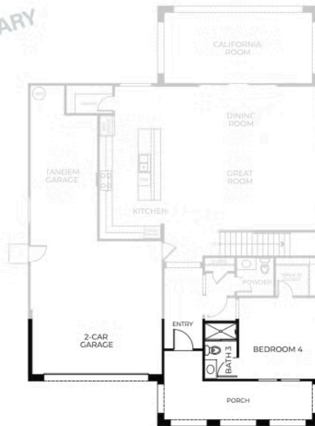
FIRST FLOOR - ELEVATION E