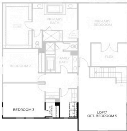
SECOND FLOOR - ELEVATION F

Preliminary and subject to change. 909-570-8617 | ShadyViewSales@TrumarkHomes.com | 18189 Via La Cresta, Chino Hills, CA 91709 | VIP-SHADYVIEW.COM