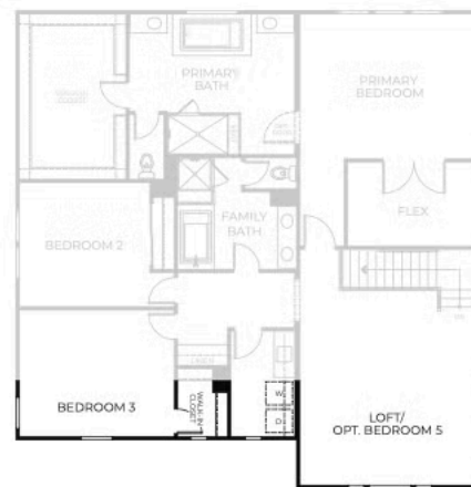
SECOND FLOOR - ELEVATION E

Preliminary and subject to change. 909-570-8617 | ShadyViewSales@TrumarkHomes.com | 18189 Via La Cresta, Chino Hills, CA 91709 | VIP-SHADYVIEW.COM