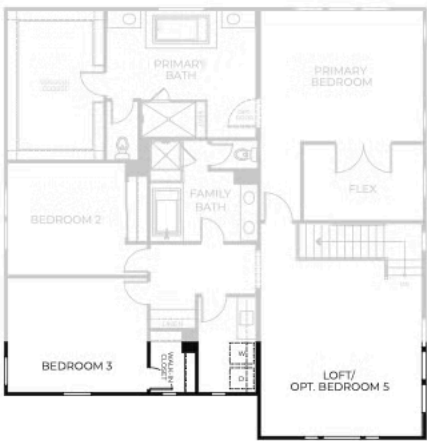
SECOND FLOOR - ELEVATION E

Preliminary and subject to change. 909-570-8617 | ShadyViewSales@TrumarkHomes.com | 18189 Via La Cresta, Chino Hills, CA 91709 | VIP-SHADYVIEW.COM