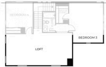
SECOND FLOOR - ELEVATION B

Preliminary and subject to change. 909-570-8617 | ShadyViewSales@TrumarkHomes.com | 18189 Via La Cresta, Chino Hills, CA 91709 | VIP-SHADYVIEW.COM