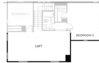
SECOND FLOOR - ELEVATION C

Preliminary and subject to change. 909-570-8617 | ShadyViewSales@TrumarkHomes.com | 18189 Via La Cresta, Chino Hills, CA 91709 | VIP-SHADYVIEW.COM