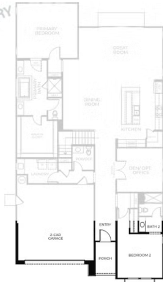
FIRST FLOOR - ELEVATION B