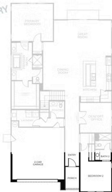
FIRST FLOOR - ELEVATION B