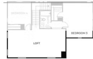
SECOND FLOOR - ELEVATION B

Preliminary and subject to change. 909-570-8617 | ShadyViewSales@TrumarkHomes.com | 18189 Via La Cresta, Chino Hills, CA 91709 | VIP-SHADYVIEW.COM