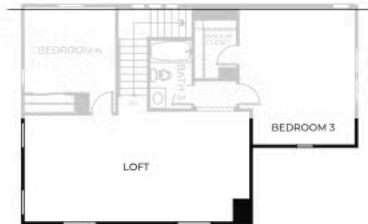
SECOND FLOOR - ELEVATION C

Preliminary and subject to change. 909-570-8617 | ShadyViewSales@TrumarkHomes.com | 18189 Via La Cresta, Chino Hills, CA 91709 | VIP-SHADYVIEW.COM