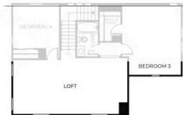
SECOND FLOOR - ELEVATION B

Preliminary and subject to change. 909-570-8617 | ShadyViewSales@TrumarkHomes.com | 18189 Via La Cresta, Chino Hills, CA 91709 | VIP-SHADYVIEW.COM