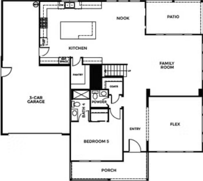
ELEVATION A, B & C FRONT LOAD GARAGE