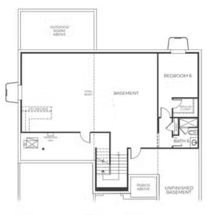
OPTIONAL FINISHED BASEMENT