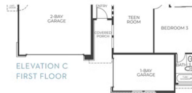
ELEVATION C FIRST FLOOR