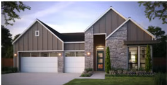
ELEVATION C – MODERN MOUNTAIN