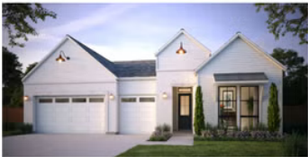
ELEVATION A – MODERN FARMHOUSE