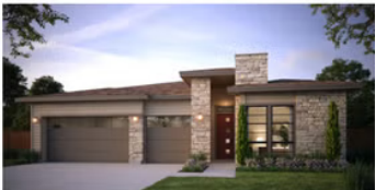
ELEVATION B – MODERN PRAIRIE