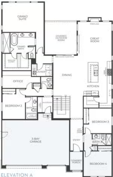
ELEVATION A FIRST FLOOR