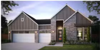
ELEVATION C – MODERN MOUNTAIN