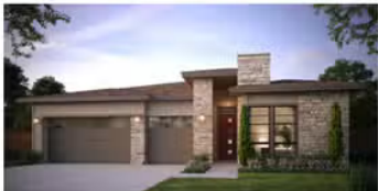
ELEVATION B – MODERN PRAIRIE