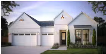
ELEVATION A – MODERN FARMHOUSE